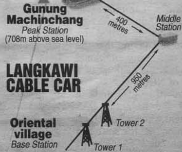
BIRD'S-EYE VIEW The view from the middle station of the Langkawi cable car project, which is due to be completed soon. The RM46mil system starts from Oriental Village in Burau Bay and ends after a 2.2km ride at Gunung Machinchang. Datuk Seri Dr Mahathir Mohamad inspected the progress of the project yesterday. More reports on Page 2.