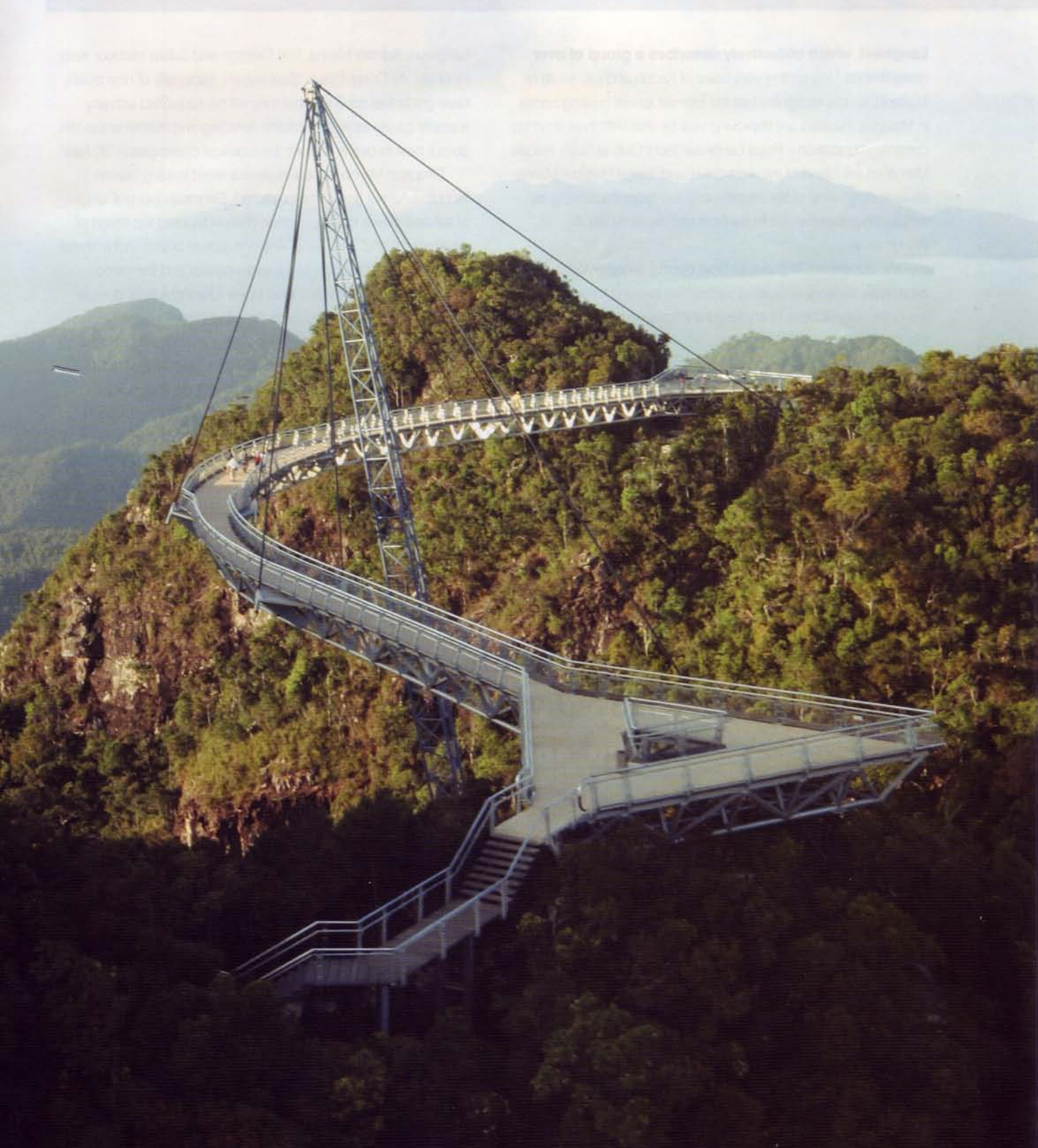
Uniquely stunning views from the awe-inspiring suspension bridge